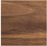
NC nussbaum canaletto