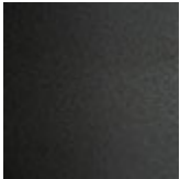
GFM69 graphit gaufriert