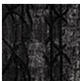
baumwolle und chenille Mumbai