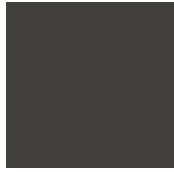
Metallo brunito Burnished metal